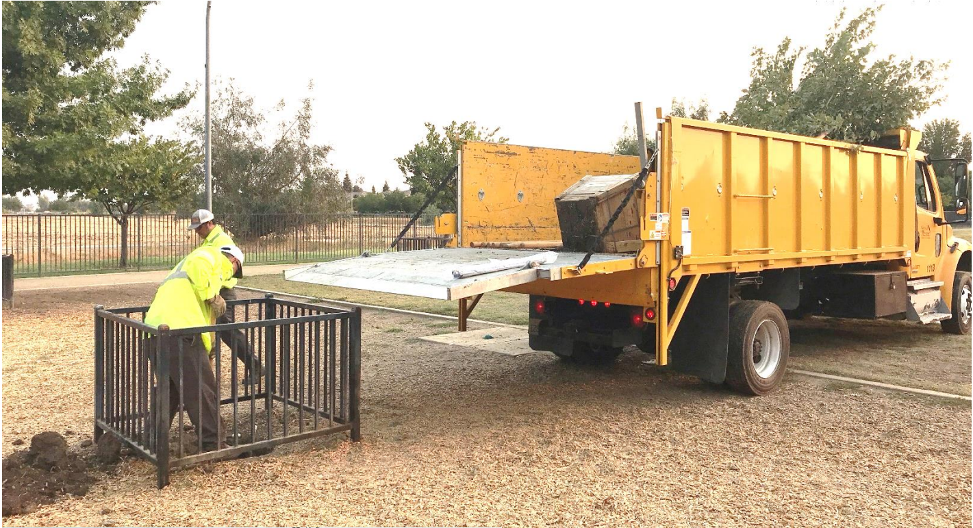
Oct 15, 2020 at 8:22:28 AM 1101-1135 W Yosemite Ave Merced CA 95348 United States