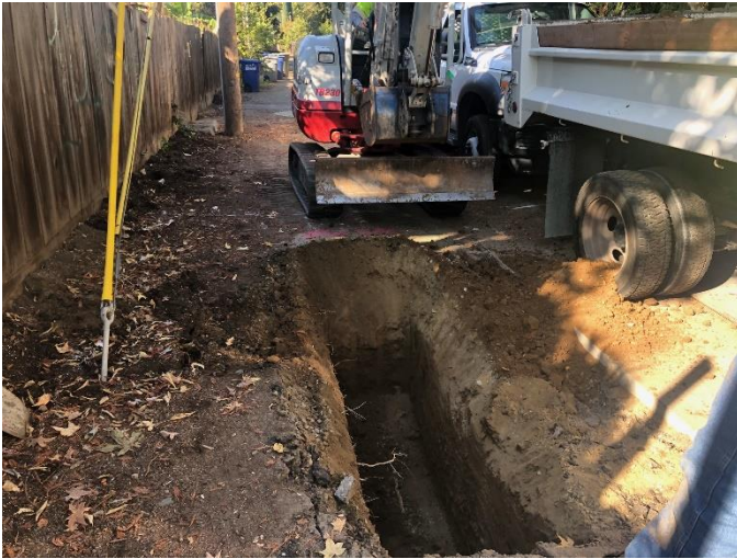
ALLEY AT ROBINSON DR. & 10 TH AVE:

Public Works Sewer crews repaired a broken/offset 6 inch sewer main in the alley at W. 18 th Street and Main Street, repaired another offset 6 inch sewer main in the alley at Robinson Drive and 10 th Avenue, as well as repaired a broken 8 inch sewer main near G Street and Alpine Drive this week.