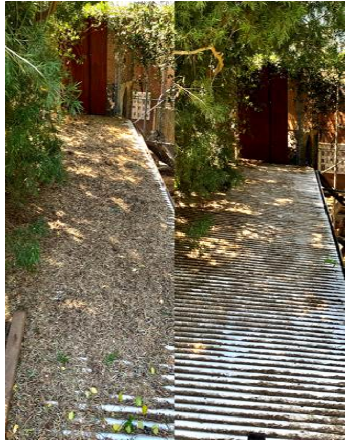
Leaves Removal from Rooftop – Before & After: