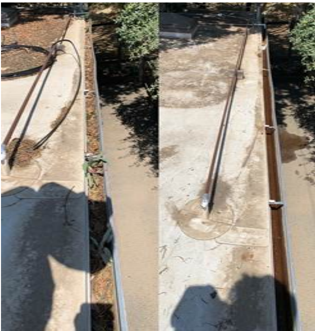
Gutter Cleaning – Before & After: