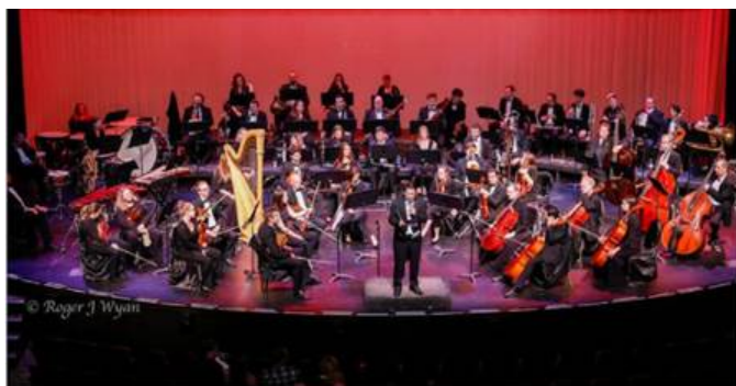
THIS SATURDAY AT 7:30 PM PDT Merced Symphony Returns To In-Person Concerts With "Reconnecting — Our Seas... Merced Theatre