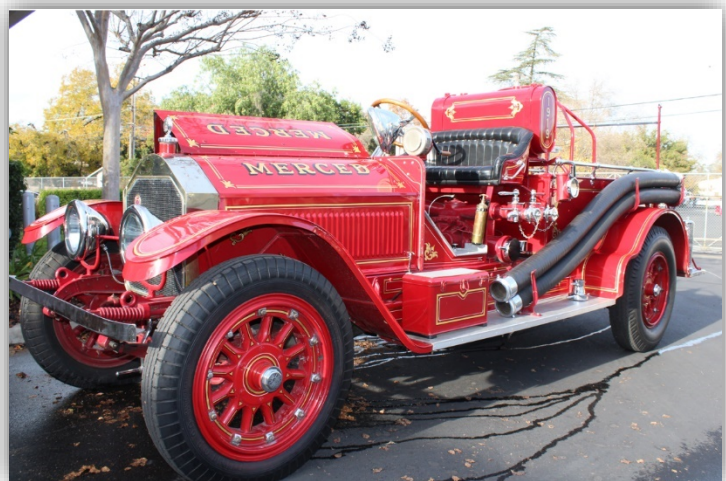
The Fire Department's 1919 Fire Engine will be on display at the 1 st Annual Cops for Critters Car Show and Trunk or Treat with bags and bags of candy for all!