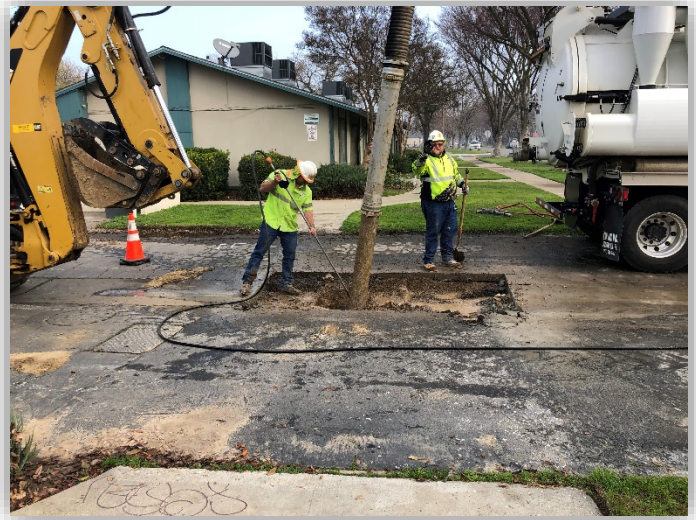
Meter installations continue in new subdivisions.