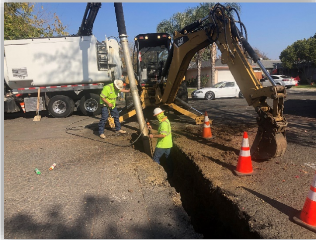
Crews replaced a leaking 1” copper service line at Partridge Dr.