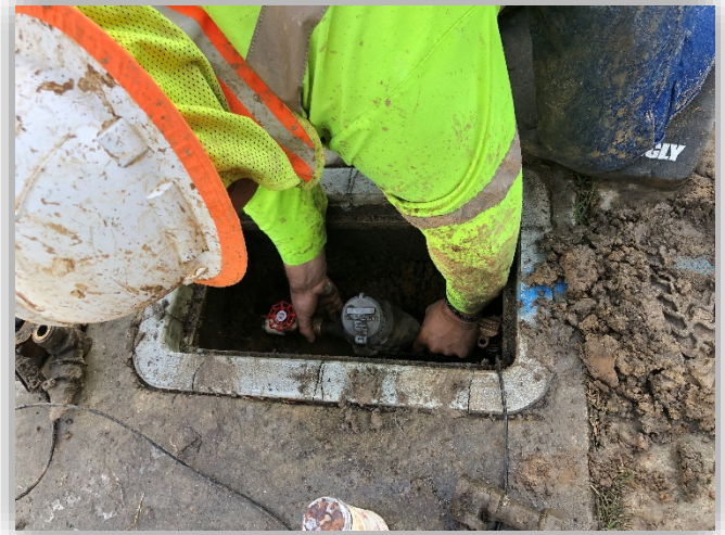
Crews repaired an irrigation leak behind Five Guys Restaurant