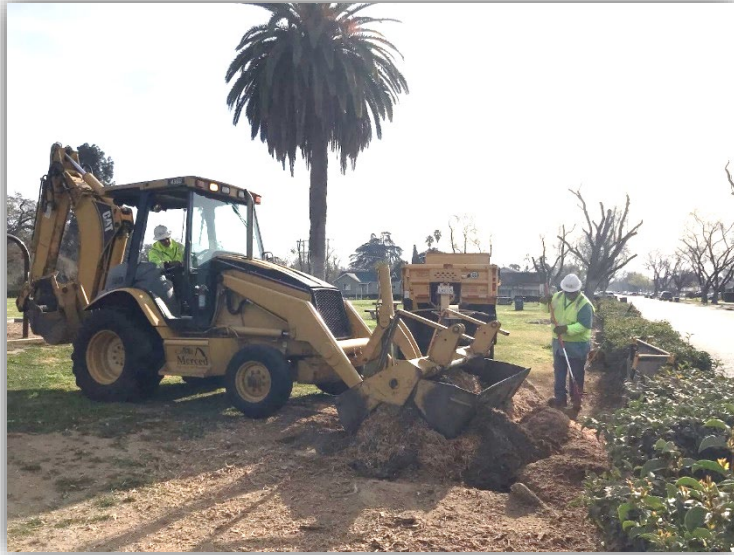
Sewer/Storm crews have started the annual discing of City lots.