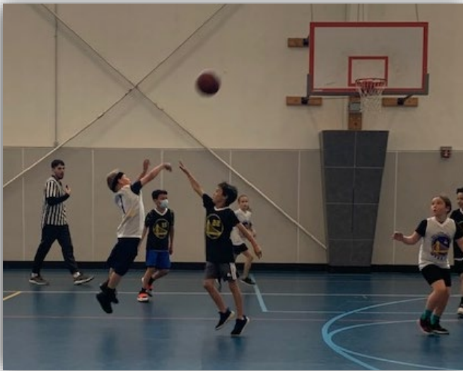
PEE WEE (3 RD & 4 TH Grades)