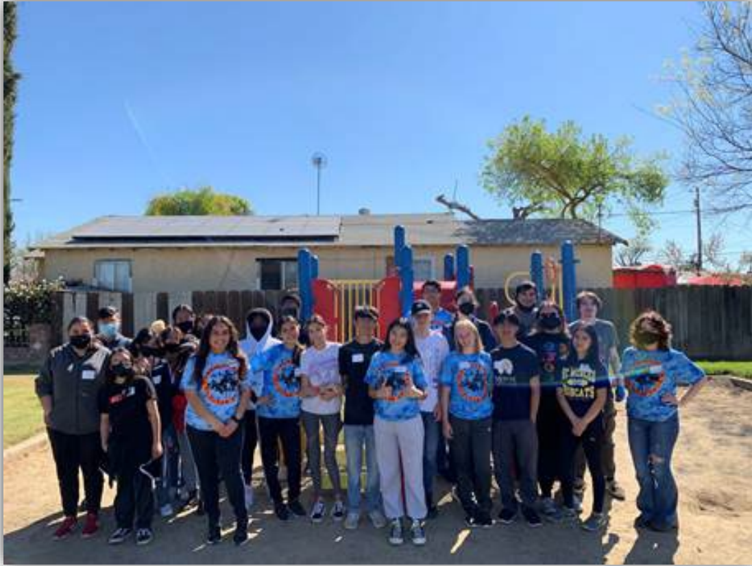
Merced Youth Council Park Cleanup

The Merced Youth Council recently gathered with city residents. As a result, it gave "The Love Veasley" Park, located at W. 6th & Canal St., a facelift, adding vibrant colors as community residents walked by in "Awe." This recent clean-up was the Council's 2nd time painting the park since 2018. The Council's last park clean-up will be April 30th, at Carol Gabriault Park, located at 1875 Willowbrook Park.