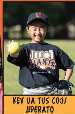
KEV UA TUS COJ/ OPERATO