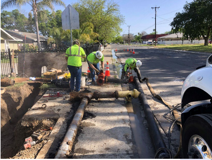
700 Block T Street