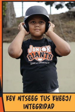
KEV NTSEEG TUS KHEEG/ INTEGRIDAD