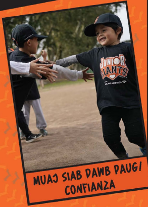
MUAJ SIAB DAWB PAUGI CONFIANZA