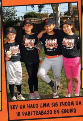
KEV UA HAUJ LWM SIB KHOOM UA IB PAB/TRABAJO EN EQUIPO