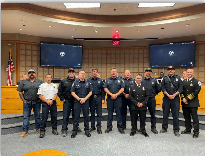
Personnel from Merced Fire