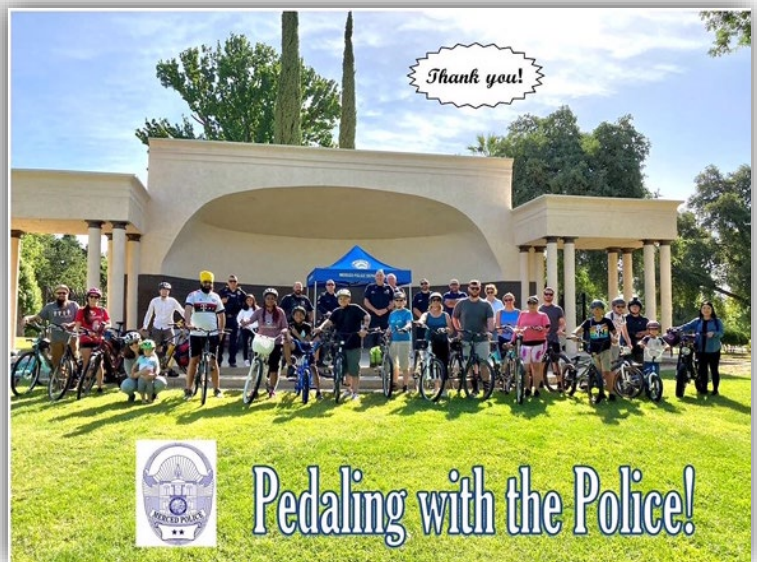
Pictured above and to the right, members of our community.

On Sunday, May 22, 2022, members of our community joined members of the Merced Police Department for Peddling with the Police. The ride looped from Applegate Park's Amphitheater to Rahilly Park and back. Riders were treated to post event BBQ. It was a great day for exercise and community.