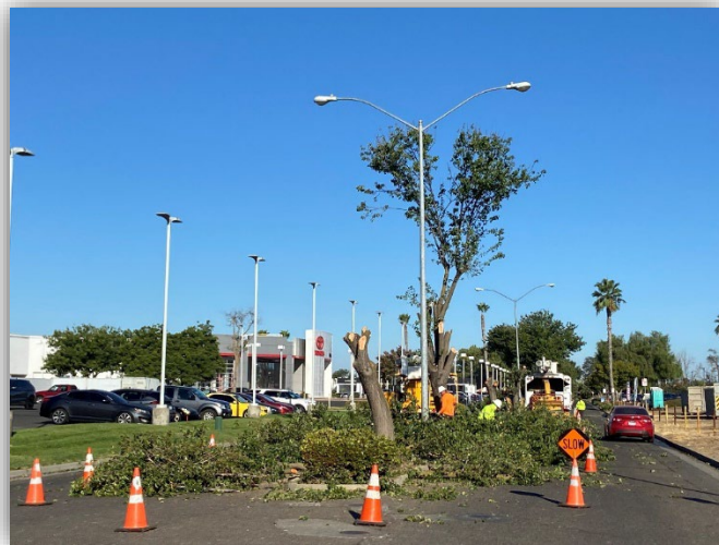
More photos of the replacement of a water main section along Martin Luther King, Jr. Way in front of the Merced County Fire Station.