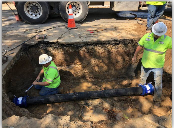
G Street & 99 Overpass