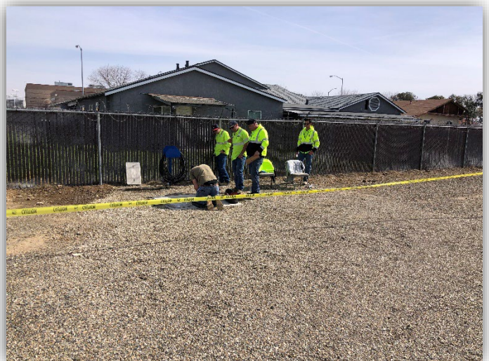
Water Distribution Operator 1/11 Skills Testing