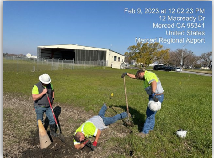
Crews clearing roots from a storm drain.