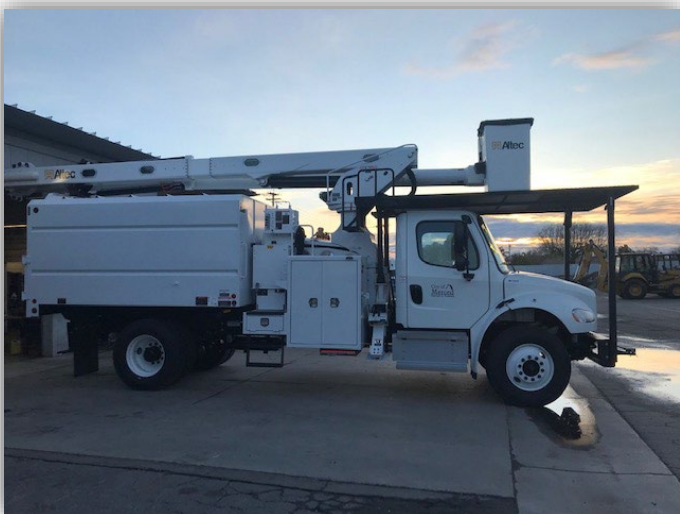
Fleet recently prepared a new aerial truck for the tree department. The truck can reach 70'.

Thanks to everyone in Public Works for the hard work and dedication.