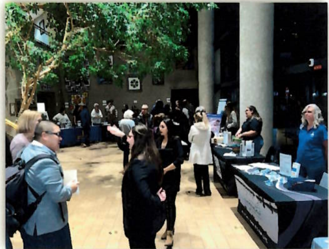
City Staff meeting with community members before the question, answer, and discussion session with city council members.