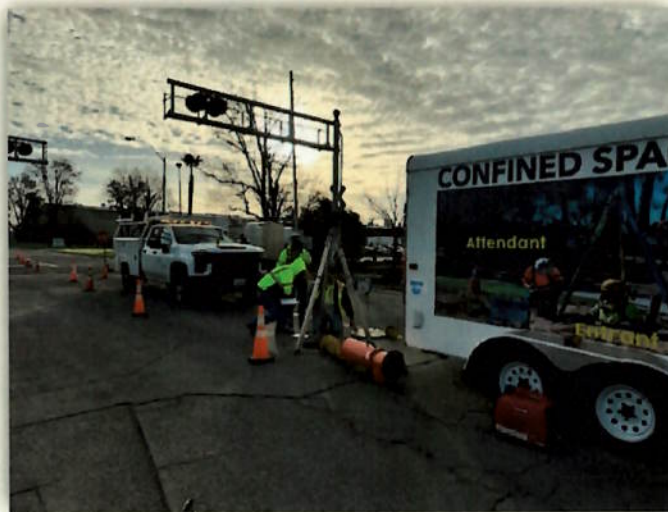
Crews installed a sewer flow meter