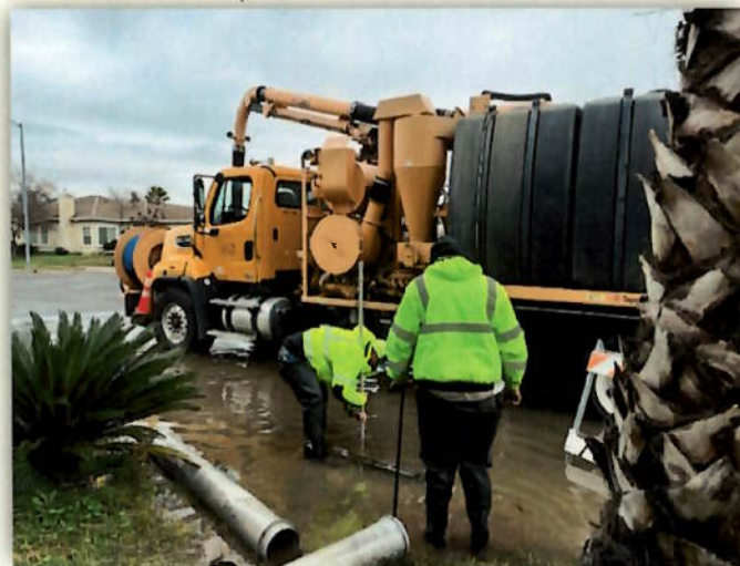
Crews pumping storm water