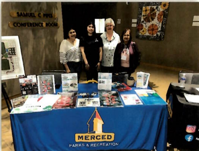
Members of the Merced Youth Council and Representatives from The Merced Senior Center joined the townhall to share information about their respective programs.