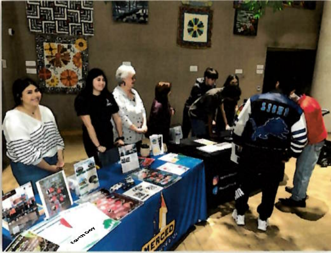
Parks & Community Services, Youth Council, and Senior Center Representative share information about City programs and services.