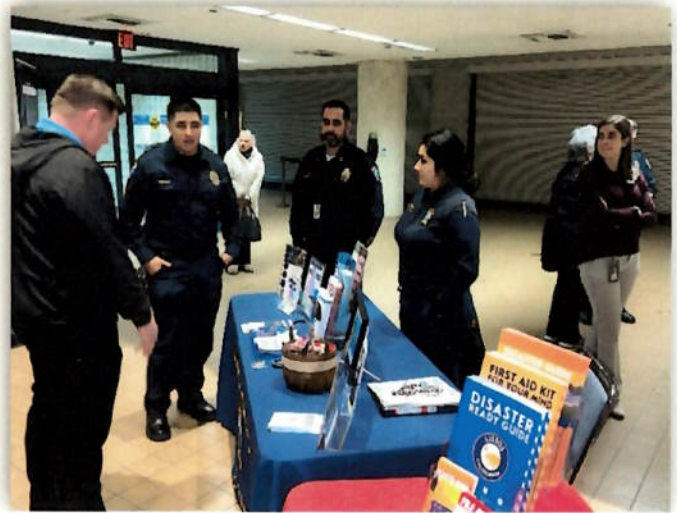
PD talked with community members about programs and services such as Neighborhood Watch, Steering Wheel Lock Giveaway, and the upcoming Coffee & Bagels with MPD.