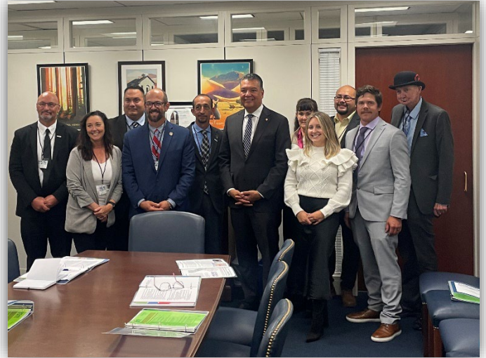
Meeting with Senator Alex Padilla

This face-to-face interaction is crucial for reviewing federal funding requests supporting these essential infrastructure projects. Twenty-five local elected officials and city and county staff participated, bolstering the advocacy efforts for all jurisdictions within the county.