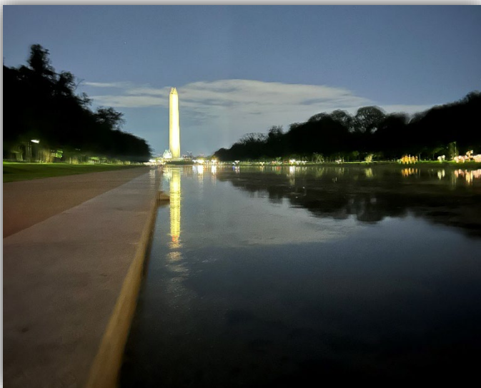
Lincoln Memorial Reflecting Pool