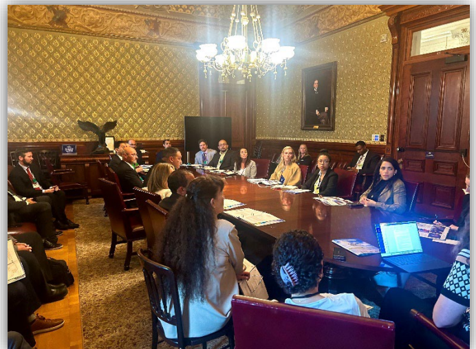
Meeting with White House Office of Intergovernmental Affairs