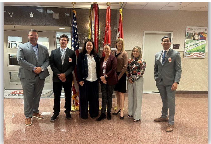
Meeting with Army Corps of Engineers