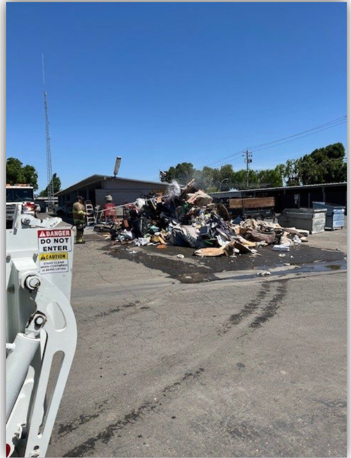
(Merced Fire putting out a truck fire caused by a power wheel with the battery left inside)

For safety, please play it safe and dispose of batteries appropriately. Thank you – City of Merced Public Works.