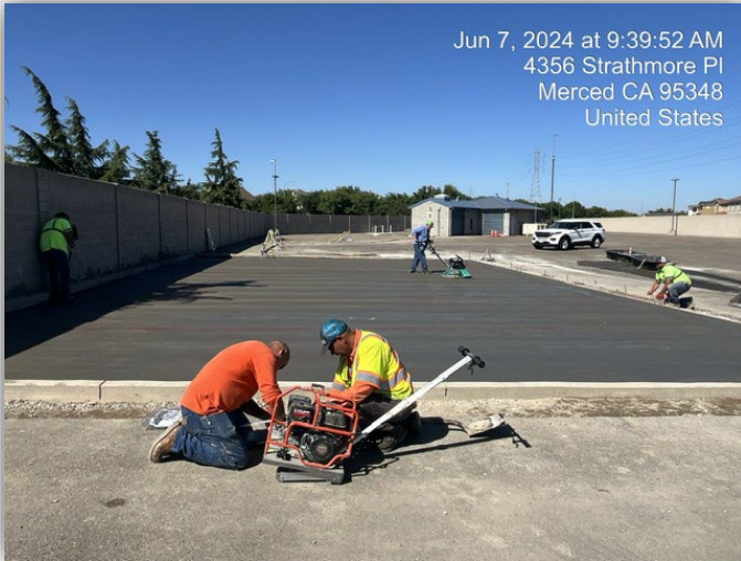
Crews working on a concrete pad at Well Site 16.