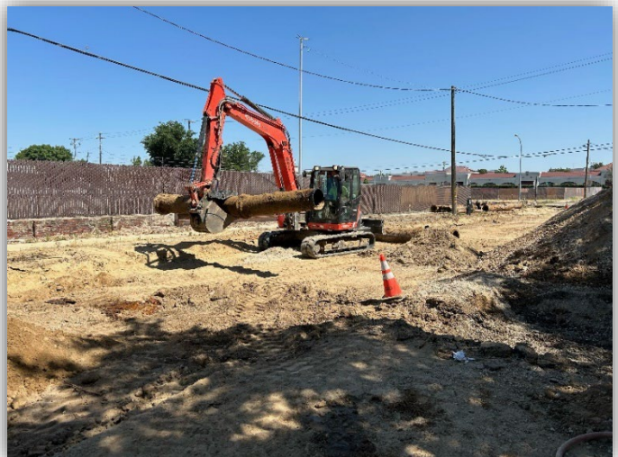
Community Park 42- Crew working on Futsal Court, finishing up the curb and gutter in the parking area, installing waterlines and grading.