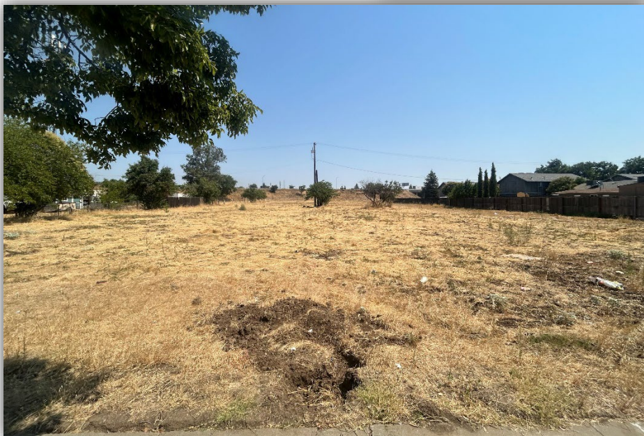
125 E. 13 th Street