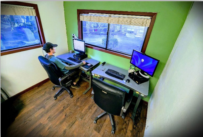
Commissary Kitchen- Expected Completion November 2024