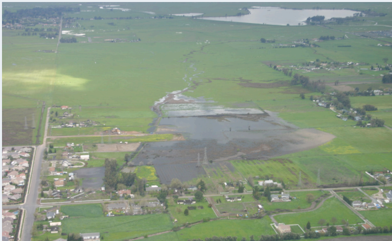
Figure 48. Image of Lake Yosemite and Area Storm Water Runoff

Image is looking north with Dunn Road in the foreground and Parsons Avenue on the left; Lake Yosemite appears at the upper right corner of the image.