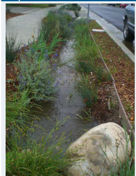
Example of a Bioswale to Capture Stormwater